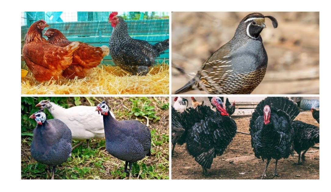
NO. 4 View Videos

A Farmer will have opportunity to buy space to upload video links